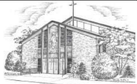
Sharing 65 years of Faith and Service!

Next weekend the 2019 Sharing God's Blessings Annual Appeal, "Serving God's People," will begin throughout the Archdiocese of Newark. Each year, the Annual Appeal provides valuable resources to parishes and schools in need, helps the poor with food, shelter and clothing, supports many pastoral ministries, funds three Archdiocesan seminaries and makes housing and medical care possible for retired priests. The Appeal reminds us that we are one with all the other parishes of our Archdiocese throughout Essex, Bergen, Hudson, and Union counties and gives us a chance to work together for God's people by sharing our God-given gifts.